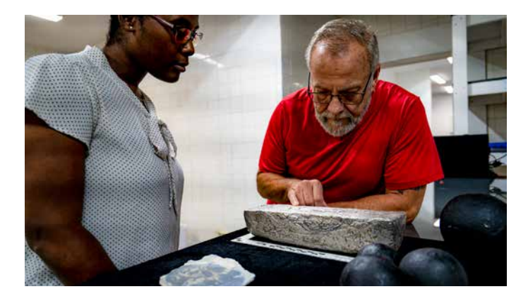
Fig. 10. Recording a silver bar from the Maravillas , newly accessioned into The Bahamas Maritime Museum.

The museum houses the most extensive library of a maritime nature, comprising around 5,000 volumes. The Bahamas Maritime Museum has also developed and runs an educational program for ages five and upwards, intended to build museum literacy and to increase awareness of the historic and cultural value of the marine environment.<sup>4</sup>