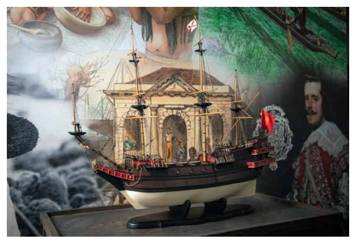
Fig. 2. Model of the galleon the Maravillas in The Bahamas Maritime Museum.