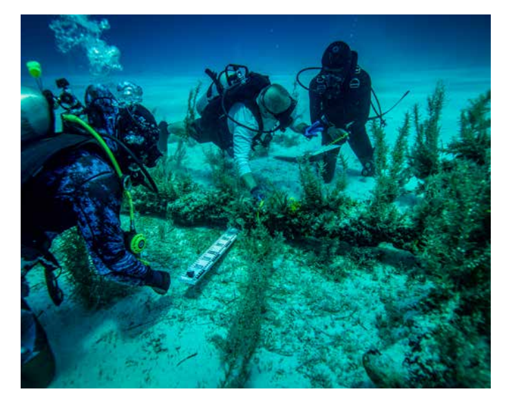
Fig. 6. AllenX divers record an historical iron anchor underwater.

NSS 16 Evo 2 down view equipment. To date, around 8,800 magnetometer anomalies have been identified (and a tiny proportion investigated to date). Core environmental data are captured during the surveys.