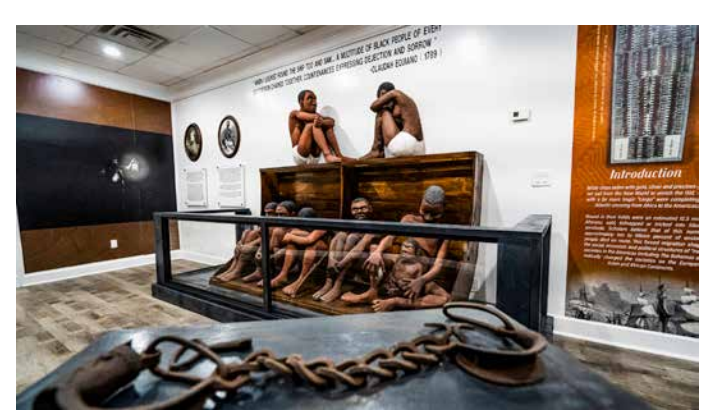
Fig. 8. A display about the transatlantic slave trade in The Bahamas Maritime Museum.

AllenX records the precise position of every Sounding Unit explored and every artifact identified from a silver coin and bar to ship fittings (iron and cupreous spikes, rigging) and potsherds. A policy of selective artifacts' recovery is followed to minimize the