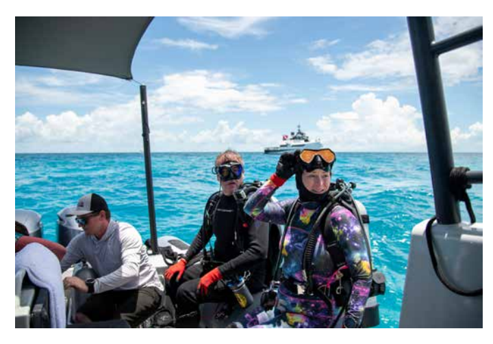
Fig. 5. AllenX divers preparing to survey the northern Bahamas.

gold- and silver-alloy ingots on the Tumbaga wreck off the western Little Bahama Bank, dated to between \epsilon . 1526 and 1536, made from Aztec loot melted down by Spanish conquistadors, distinguishing which finds came from which site cannot always be determined. Most of the Marx and Humphreys finds were sold in auctions.